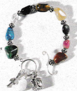
Just For Girls Psalm 23 Bracelet