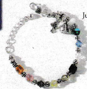
Natural Stone Psalm 23 Bracelet